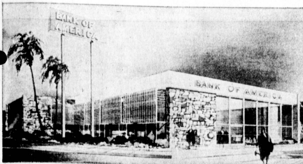
UNDER CONSTRUCTION . . . Sketch of the new Bank of America branch at Hawthorne and Sepulveda shows how the building will appear when completed by next Aug. 1. The building, land, and paved parking area represent an investment of about $450,000 and will be the bank's second branch in Torrance. It was designed by the architectural firm of Stiles and Robert Clements.