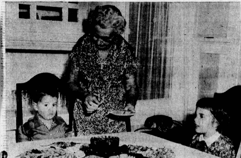
CHRISTMAS WITH GRANDMOTHER . . . Grandmother holds a very special place in the hearts of everyone and at Christmas she is especially remembered for the part she plays in filling the Yule season with love and happiness.