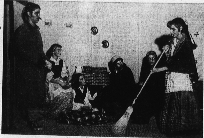
CASIMIR PAGEANT . . . In this scene from the Casimir pageant, "Why the Chimes Rang," a poor family is planning to make a trip to the cathedral on Christmas. Shown