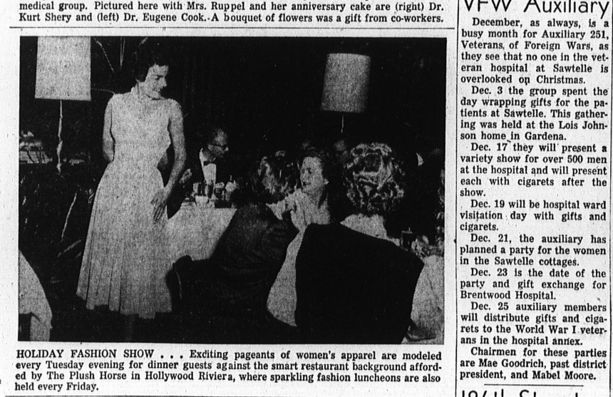
HOLIDAY FASHION SHOW . . . Exciting pageants of women's apparel are modeled every Tuesday evening for dinner guests against the smart restaurant background afford-ed by The Plush Horse in Hollywood Riviera, where sparkling fashion luncheons are also held every Friday.