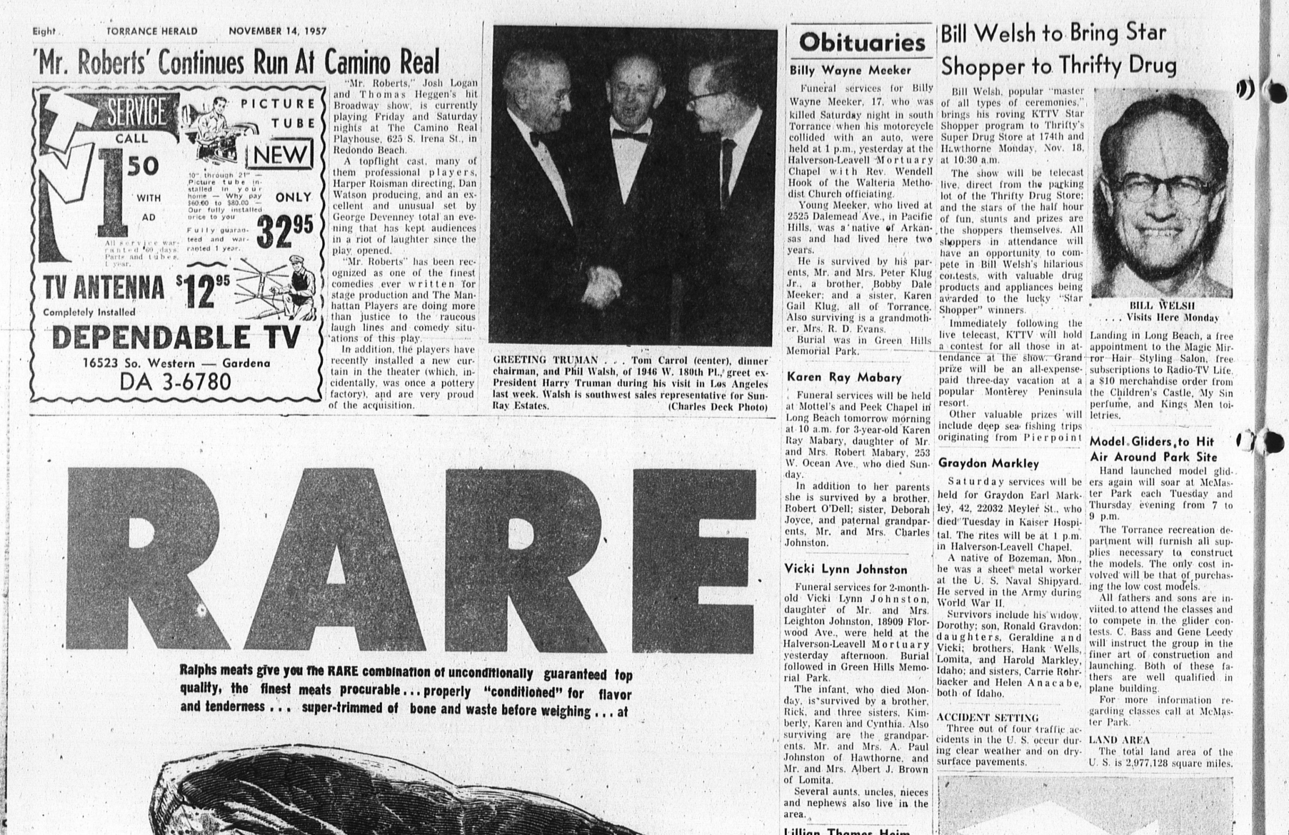
Ralphs meats give you the RARE combination of unconditionally guaranteed top quality, the finest meats procurable ... properly "conditioned" for flavor and tenderness . . . super-trimmed of bone and waste before weighing . . . at