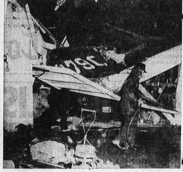
CHECK FUEL LEAKS... Battalion Chief Whitney and Engineer Dial check in the Robert James Carney garage at 2517 Dalemead St. a.ter a light plane crashed into it during the rain Sunday evening. Four occupants of the plane received serious injuries.

rs. "Another hazard is failure to "Another hazard is failure to lower the headlight beam for other drivers," he continued. "The law requires use of the lower beam when approaching an oncoming car within 500 feet and when following an-other vehicle within 200 feet.