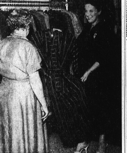
FOR MODERN WOMEN . . . Modern clothes for modern women are featured at The Modern Woman, exclusive new shop in the South Bay Shopping Center. Here, a customer looks at one of the new creations.