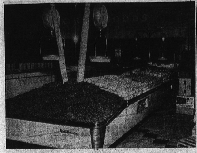
READY FOR SHOPPERS . . . Part of the extensive produce section of the new Safeway Store at Carson and Western Ave., is shown here, ready for shoppers at the new market. Field fresh vegetables and fruits from the choicest garden spots of the nation can be found daily on the produce tables of the modern market.