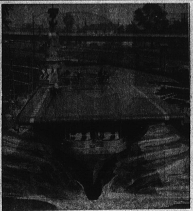
AIRCRAFT CARRIER . . . This 48-foot replica of an Essex type aircraft carrier will be on display at the Civic Center for two days during the Torrance Rauchero Days Celebra-tion July 24 through 28.