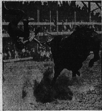
HE FLIES THROUGH THE AIR . . . Scenes like this will be seen at the rodeo to be held in connection with Torrance Ranchero Days. The rodeos will be held on Saturday and Sunday, July 27 and 28, at the Civic Center, starting at 2 p.m. each day. It is sponsored by the Torrance Mounted Police and Torrance Lions Club.

The club meets at 6:30 p.m. each Thursday at the Torrance Women's Club, 1422 Encinara.