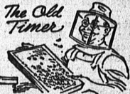
"Let's all swap problems—since everyone always knows how to solve the other person's."