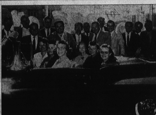
THE FINEST SERVICE AND SALES DEPTS. READY TO SERVE YOU BEST!