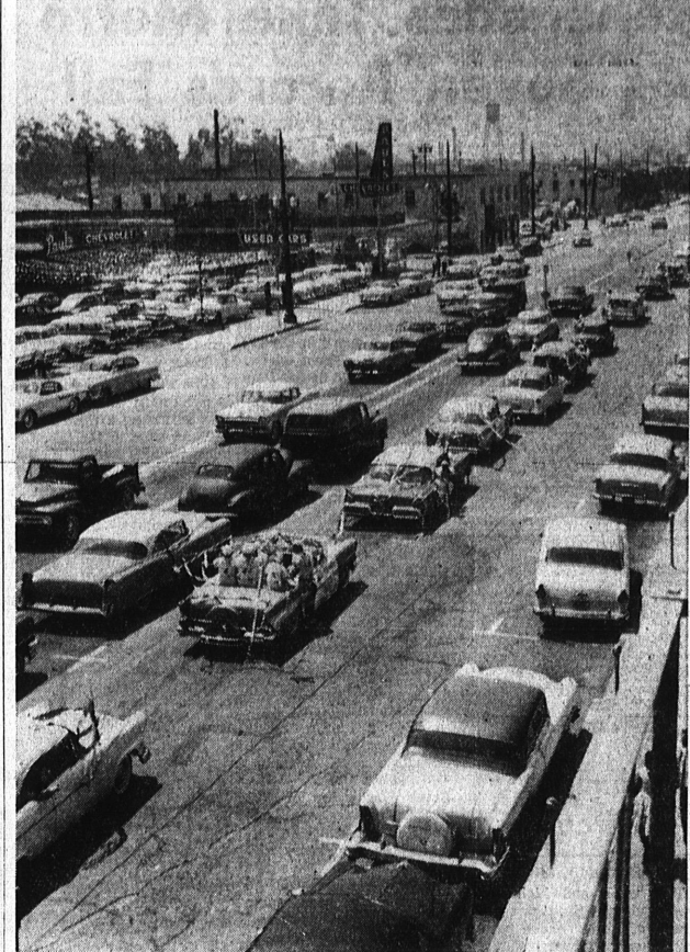
SEASON OPENED.. The Little League season in Torrance was opened here with a parade and afternoon of baseball yesterday. Here the parade makes its way down Cabrillo Ave. toward the Plaza Del Amo park to get the serious part of the day under way—the ball game.