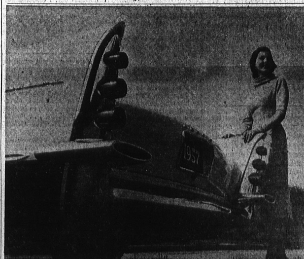
UPSWEPT FINS . . . DeSoto's new signal tower tail lights are seen on this 1957 Fire-dome model. The upswept tail fin house separate signal lights that operate only when the brake pedal is depressed or the turn indicators are flashing. Also built into the assembly are dual tail lights and back-up assemblies. The chrome-covered exhaust extensions are below the tail light assembly. The car will go on display Tuesday at Whittlesey Motors, 1600 Cabrillo Ave.

Whittlesey said, "We're extremely proud to cordially invite the public to inspect and try the exciting new 1957 De Soto in our showroom Tuesday. Our doors will be open all day. In view of the wide public interest we expect in the all-new and unusual features of our new De Soto cars, we advise early attendance to assure a full, complete inspection and demonstration."