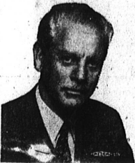
RE-ELECT CECIL KING CONGRESSMAN