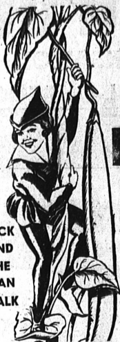
JACK AND THE BEAN STALK