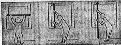
Width outside casing Height outside casing Height from top of casing to floor