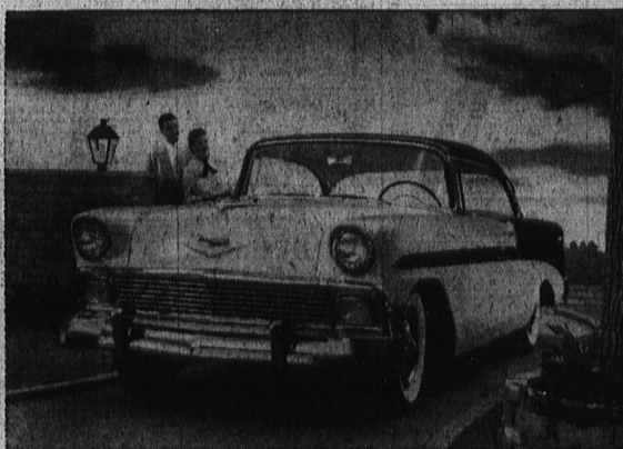
BEL AIR SPORT COUPE

BE AMONG THE FIRST to select the car of your choice from among our fleet of executive cars. Most of the wanted models are available now, ranging up to beautiful cars with the most luxurious equipment.