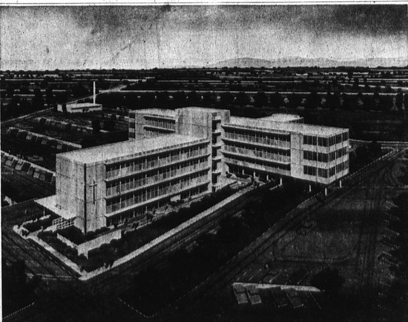
CATHOLIC HOSPITAL... Construction is slated to begin next year on this four-story, 125-bed facility which will go up at Torrance Blvd. and Earl St. A general hospital, the structure will contain surgical, medical, emergency and

St. They are accused of picking up the girl and taking her to the Standard Oil Lease at Lomita Blvd. and Crenshaw Blvd. The girl told authorities she was held for three hours and repeatedly attacked by the five and by about eight other boys. The others are juveniles and have been dealt with by juvenile authorities.