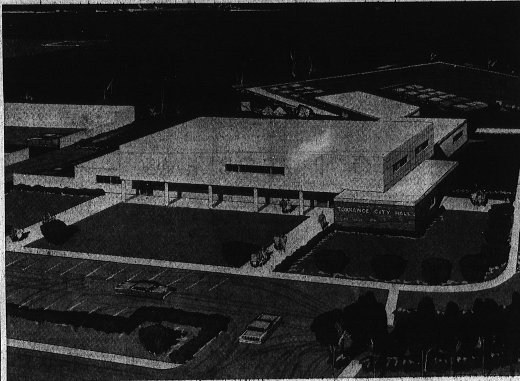
SCENE OF DEDICATION . . . This perspective of the new Torrance city hall show the scene which will be the center of attraction Saturday afternoon as officials headed by Lt. Gov. Harold J. Powers meet to dedi-

cate the million-dollar civic center facilities. The police station and municipal plunge will be dedicated at the same time.