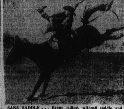
SANS SADDLE... Bronc riding, without saddle and sometimes rider, will be one of the events featured at the 1956 Torrance Rodeo, Aug. 11 and 12. The rider can't touch any part of the horse with his free hand, but there are no regulations governing the actions of the bronc as it tries to dump the rider.