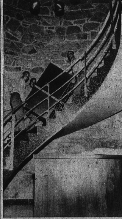
HEADED UPSTAIRS . . . It's not the haul to the new city buildings, but the trip upstairs that had the crews of Torrance Van & Storage panting during the move of city offices yesterday. Here three of the moving firm's men inch a heavy file case up the circular stairs off the lobby of the new city hall.

The callbacks started after the announcement in New York Friday that contracts between United Steel Workers and U. S. Steel had been signed.