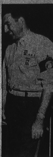
Checks pint of blood he audiforium Monday. Flank in. All three, who handle blood.

We service more sets in the home than any other shop! This means savings to you! SAV-MOR TV FA 8-6110