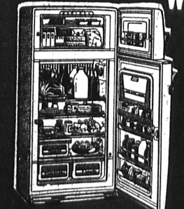
DELUXE 2-DOOR REFRIGERATOR

WINNER MAY CHOOSE ANY APPLIANCE SHOWN HERE-FREE!