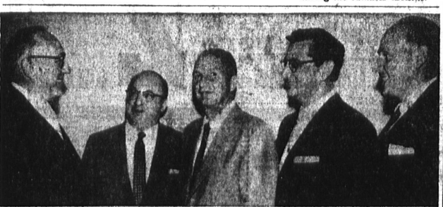
JOINS HOSPITAL BOARD .

Torrane's PTA Coordinating Council will meet tonight at Greenwood School at 7:30