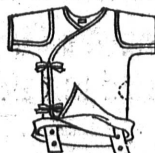
The Shirt. Double-breasted. Tuttleless ties. Sizes: 3 mos.-1 1/2 yrs. White. $1.00

Find a little Carter gift she'll love right here: