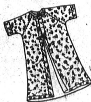
Headed Kimono. Snap closing through ribbon bows. Featherstitch trim. 6 mos. size only. Pink, blue, yellow, green, white. $1.69