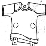
Shirt. Nevabind sleeves. Jiffon neck. White. Sizes: 3 mos.-3 yrs. Pastels. 6 mos.-1 1/2 yrs. 79¢