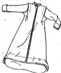
Sleeping Bag. Fold-over Handy-Cuffs. Unlined bottom. 2-way slide fasteners. 1 size grows to 3 yrs. Blue, green, pink, yellow. $3.50