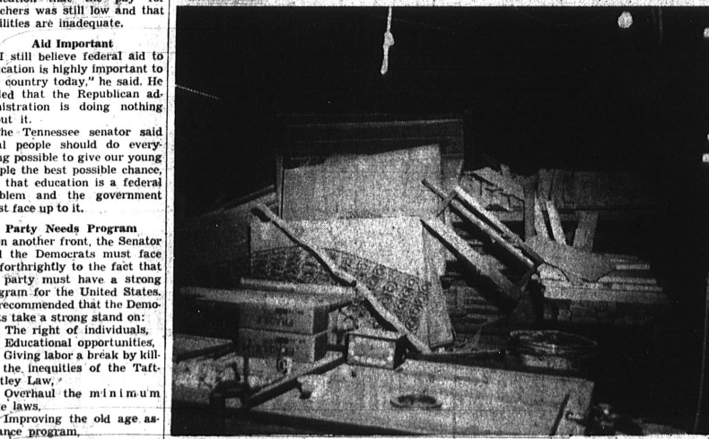
i smashed in the frame parti-caused by the flaming LITTERED DEBRIS .... Is the product of background. Discoloration along the paneling was ticles forced through the wall by the blast.