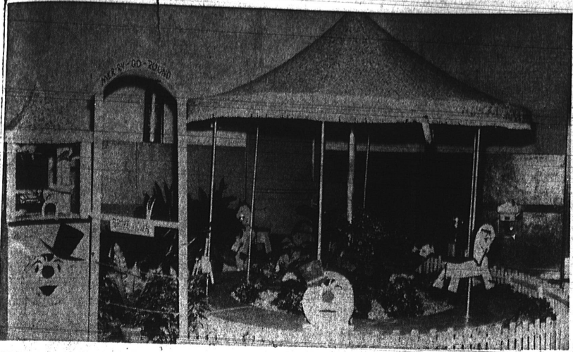
GOLD CUP WINNER . . . This entry of the Lomita F Club won the gold cup for club entries in the Toi Flower, Art and Hobby Show in the Civic Auditorium