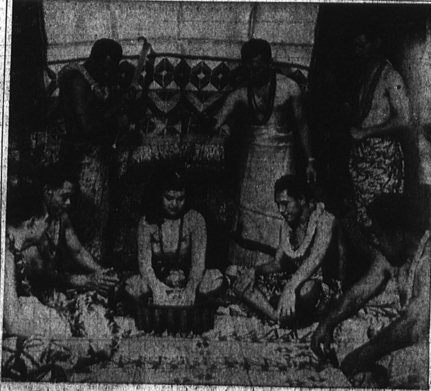
PREPARING POR PESTIVAL., ... Members of the Church of Jesus Christ of Latter-Day Saints are all deciped out in Polynesian garb to set the scene for the "Polynesian Festival" to be held at 2160 W, 174th St. on May 5. The festival is being held to raise funds for the construction of the Gardens Ward-Redondy-Stake house. Highlights of the festival will be the presentation of the "Rava," a Samoun coronomy revolving around the creation and consumption of a non-toxic drink made from the root of the Samoun Ava tree. (Story on Fage 30.)