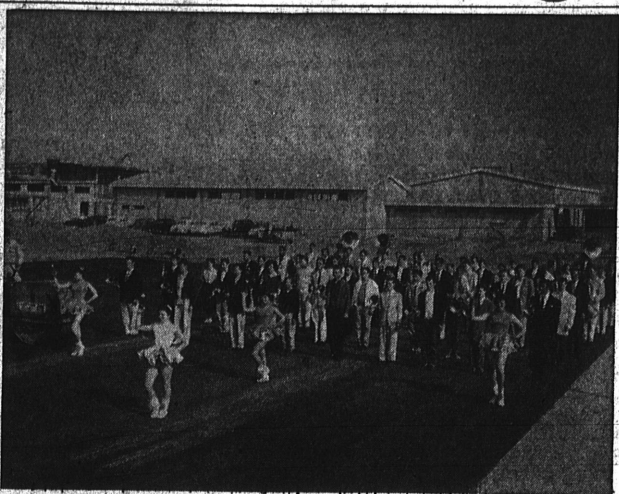
SOUND THE BUGLES . . . North High's drum majorettes lead the band in celebration march to inaugurate the new black-top area that will be marked off into tennis courts, volleyball courts, and a student parking lot. Still under construction are the gymnasium, music building, and the cafeteria.