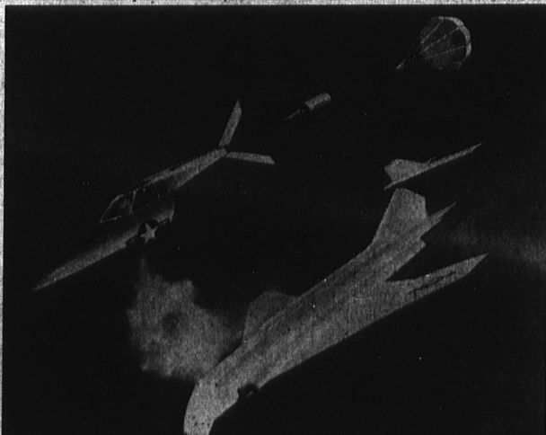
SUPERSONIC ESCAPES . . . Artist's conception of an escape capsule which appears capable of permitting pilot escape at supersonic speed at high altitude. In certain types of space craft it appears likely that the final stage of the craft devoid of its fuel and other fire hazards might well be designed to serve the combined function of normal flight and escape vehicle.