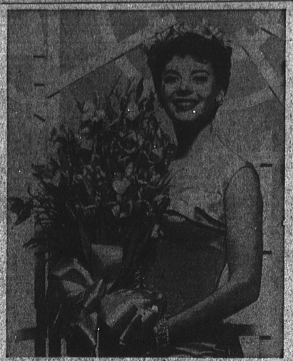
FLOWER QUEEN... Natalie Wood, one of Hollywood's fastest rising stars, has been selected queen of the California International Flower Show, which opens March 17 at Hollywood Park. The annual affair will run until March 25 at the Inglewood race track.