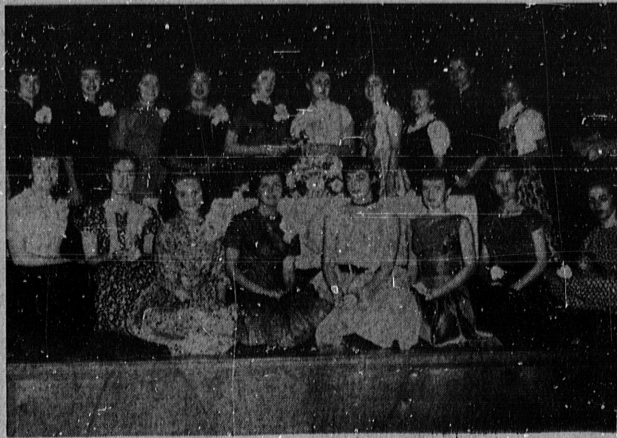
GAA INSTALLATION . . . Shown above are members of Torrance High School GAA who were recently installed in office. Taken at Torrance High School auditorium, the picture shows presentation of the gavel.