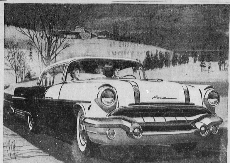
STAR CHIEF FOUR-DOOR CATALINA