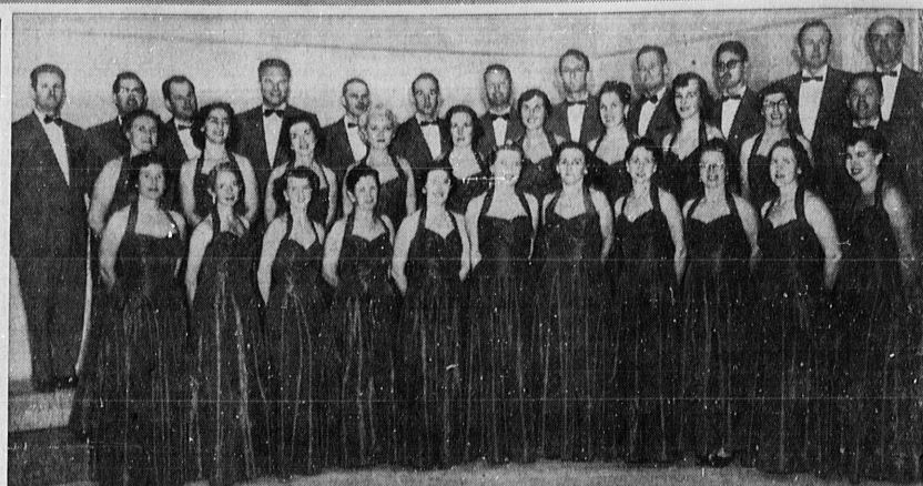
SINGING THE JOYS OF CHRISTMAS... on Channel 9 television on Saturday evening, Christmas Eve, at 8 p.m., will be the Los Cancioneros Choral Group from Torrance. Los Cancioneros, one of the outstanding choral groups in Southern California, has won wide recognition in musical

Special note to one of my neighbors: Last week I received your story about your troop of Brownies or Girl Scouts. Today when I settled down to write