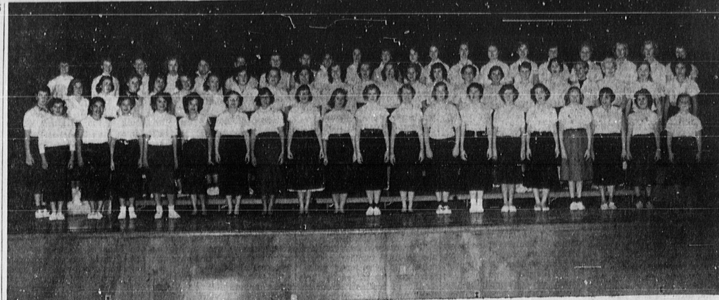
YOUNG SINGERS . . . The Torrance High School Girls' Glee Club will have a featured role in the high school's first annual Christmas program next Thursday night. Sixty-five girls belong to the club and will combine with the THS Tartar Choir to open the program with a Christmas procession.

Another factor which added to the prestige and growth of