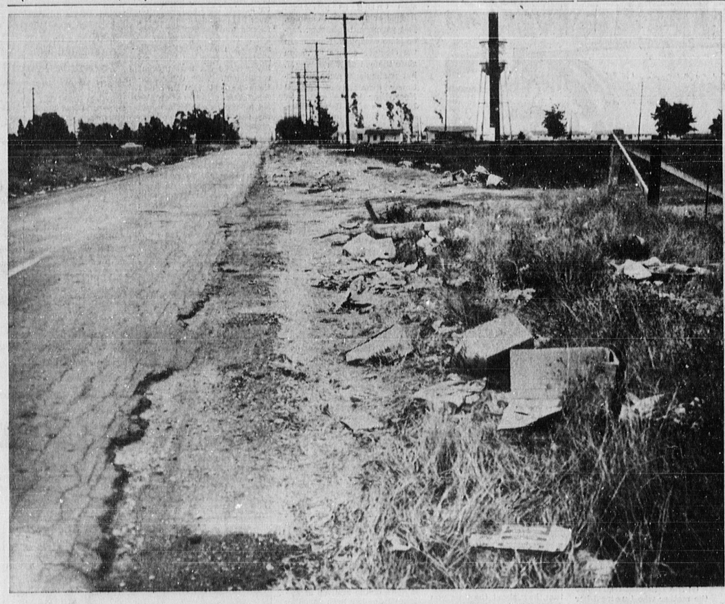
TARGET FOR TODAY... Streets like this dirty North Torrance section of Arlington Ave. have become the target of a citywide clean-up campaign which is being launched at the direction of the Torrance City Council. City crows went to work vesterday cleaning up these streets, which are prevalent