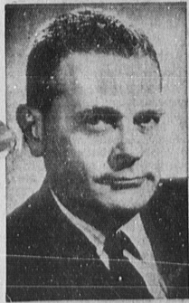
TOSCHA SEIDEL ... Concertmeister