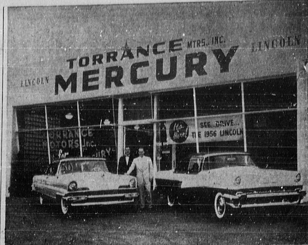
TORRANCE LINCOLN-MERCURY SHOWROOMS . . . New Auto Agency

DID YOU KNOW THAT you can make savings deposits or withdrawals—or payments on a Torrance loan—at any one of our 560 California branches? It's simple and easy...and something available to you only at Bank of America.