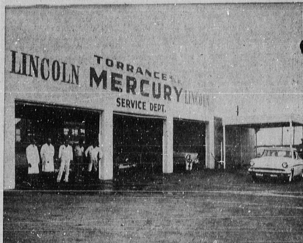
TORRANCE LINCOLN-MERCURY SERVICE CENTER . . . Facilities