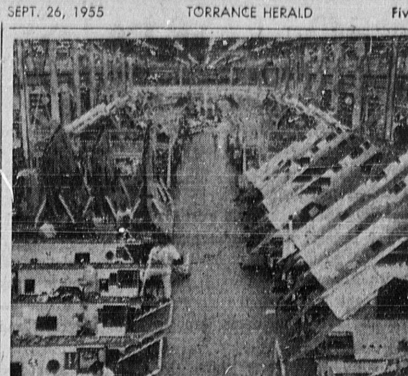
CENTER WING SECTIONS . . . Mounted on jigs for easy accessibility in construction, two of these sections will form the thin, swept, low-aspect-ratio wing. A similar method is used for the folding outer wing sections.