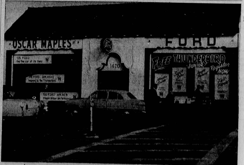
FIELD HEADQUARTERS DURING PRICE WAR