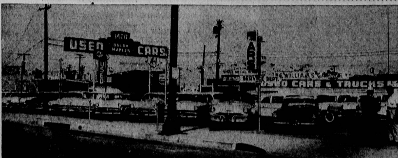
ROW UPON ROW OF NEAR NEW USED CARS!