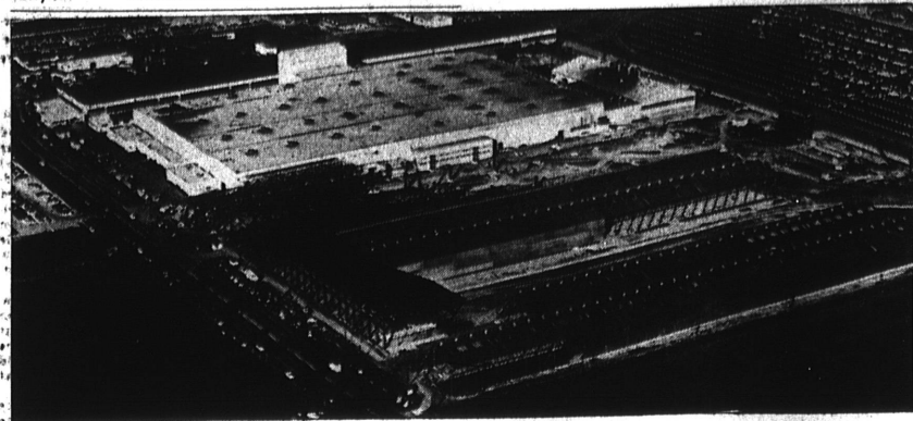
TORRANCE PLANT EXPANDS . . . The Harvey Aluminum Company of Torrance is expanding its plant to about double its present capacity. Shown here from the air are the addi-