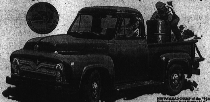
NEW PAYLOAD CHAMP of the "1/2-ton" Pickup! GVW 5,000 lbs., in rated 500 payload up to 1,715 lbs.