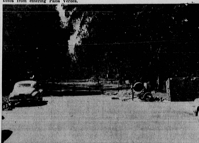
. . . A similar situation exists on another Torrance frontier, at Via Pasqual. Here Palos has shut off a through street.