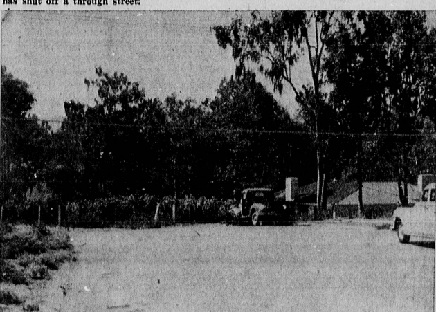
... A hedgerow has been added to the "iron curtain" thrown up across via Alameda to Torrance residents from encroaching.