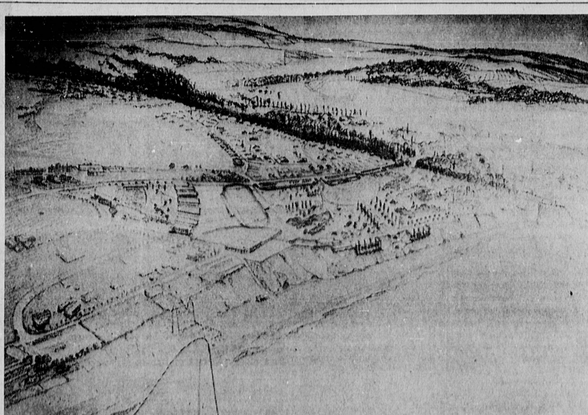
BEACH OF THE FUTURE . . . This drawing shows how Torrance Beach could be improved into a picnic-recreational center. Drawn by William Woollett, city-retained architect, it shows what facilities could be placed on the beach if money were made available. A swimming club and pool (under airplane wing) and an esplanade further up