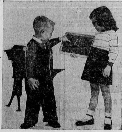
SMALL FRY . . . will find learning fun when they attend classes in such durable clothes like this knit 'tick tock' polo outfit for the girl and solid pullover worn with corduroy overalls for the boy.