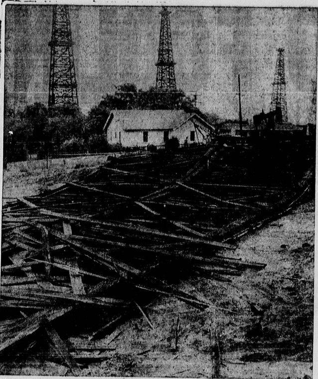
OUT WITH THE OLD . . . This derrick in the Torrance Oil Fields near 231st St. and Pennsylvania Ave., was taken down this week as a part of the campaign to clean up the oil fields. Rendered old-fashioned by modern pumping techniques, the old wooden derricks are dropped after the legs are sawed, with an assist from a tow truck. The wood is burned. In use since 1923, this 122-foot derrick is the sixth derrick to be taken down recently. Several more will be removed soon.