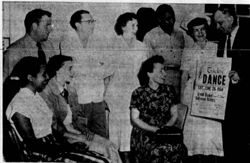
"COME AS YOU ARE" . . . is the theme, so these executives of the Harbor Hospital Employees Assn., Inc., will be dancing at the Hollywood Riviera Clubhouse Saturday night, June 26, in their hospital work clothes. Showing off dance poster