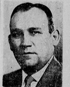
Yes, Thanks a Million, Folks!

I sincerely and deeply appreciate the tremendous vote you gave me in the June 8 primaries and I want you to know I am humble and grateful. . . . I also wish to publicly express my thanks to those who worked so devotedly in the interest of my re-election; and too, to thank the many thousands who went to the polls and voted. . . . It is your kind of citizen who has made, and will continue to make, this glorious land of ours Great, Strong and Free.