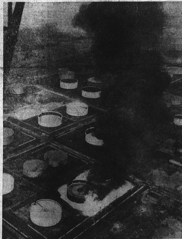
FROM THE AIR . . . In a plane piloted by Bob Pfeleger, operator of Eagle Aviation at the Torrance Municipal Airport, a Herald photographer snapped this aerial view of the $250,000 Union Oil Company fire Friday which blackened the sides over the city with dense smoke until the fire was brought under control late in the afternoon. The two tanks of gasoline burst into flames at 4:50 a.m. No one was injured. The blazing tanks are located a few yards from other tanks which exploded and burned in another spectacular fire in 1950.