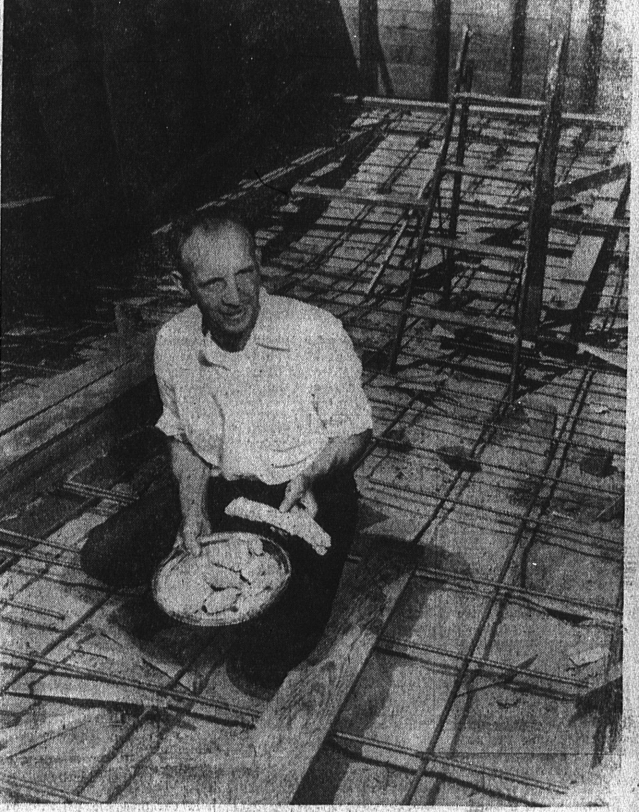
BUILDING FOR PLEASURE

schools. Huge Plans Plans for the huge 2000,home development west of Hawthorne Ave. are continuing and engineering details have been worned out, according to city officials. Torrance's building boom is here, and it appears that it is going to stay for a while.