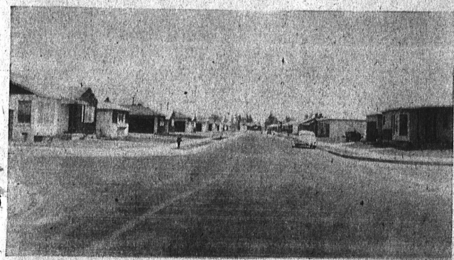
QUIFT STREETS... The builders have moved on, but the street isn't the busy acent twill be in a few weeks when families fill the houses along both sides. This North Torrance development was finished a few weeks ago.