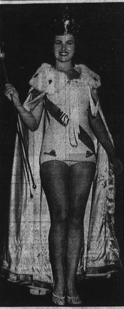
MISS UNIVERSE OF 1954 ... To Crown Torrance Queen