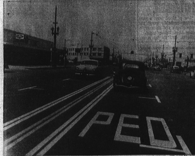
NEW PARKING . . . Cars began using the new center parking areas on Cabrillo Ave. south of Carson St. this week after city crews lined off the spaces Thursday. The parking zone from south of Carson St. to 218th St. was approved by the City Council Wednesday evening.